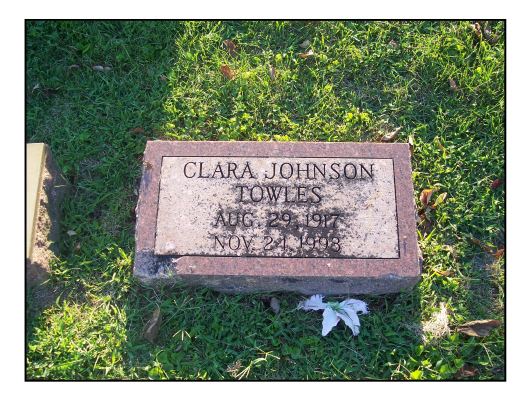
Last printed 6/1/2009 8:16 PM